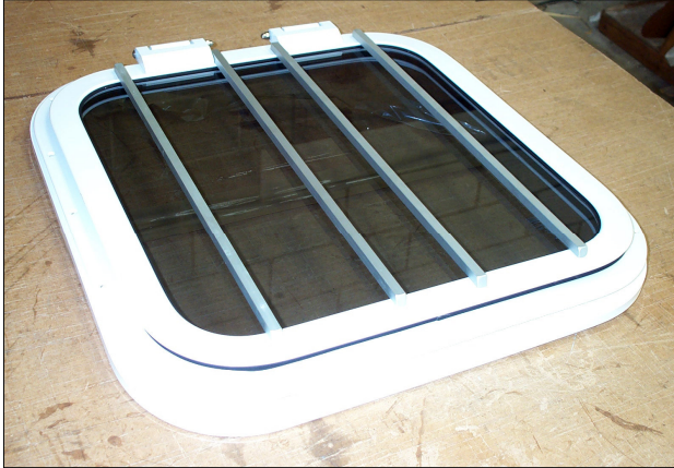
Hatch with protection bars for added durability

Aluminium bars can be placed over the glazing on our hatches for additional strength and durability. The bars act as an additional layer of protection against scuffs and scratches occurring on the glass and act as a deterrent towards walking on the surface of the hatch.