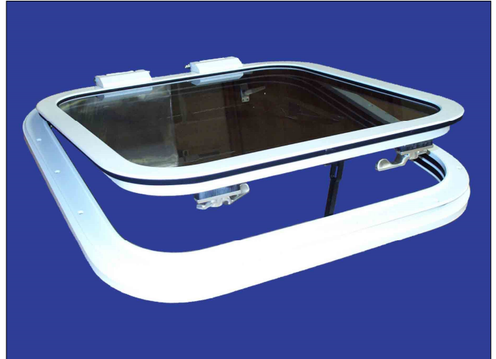
Fully glazed series 51 weathertight hatch with grey tinted glass